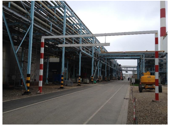
DTS monitoring of ammonia tanks; the “pipe rack” on the campus

DTS alarms are communicated to the plant’s control system via the internal ModBus TCP interface. No additional PC is required.