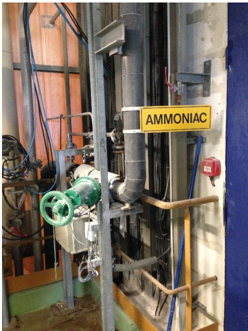
Ammonia pipeline area

A distribution pipeline network is used on the ammonia campus to transport the ammonia . Additional challenges were the large number of 3D bends throughout the network, and variations in the pipe diameter between 2 and 4 inches . To monitor all of the pipelines, a 2-channel AP Sensing DTS (Distributed Temperature Sensing) device is used to monitor the pipeline for fast leak detection.