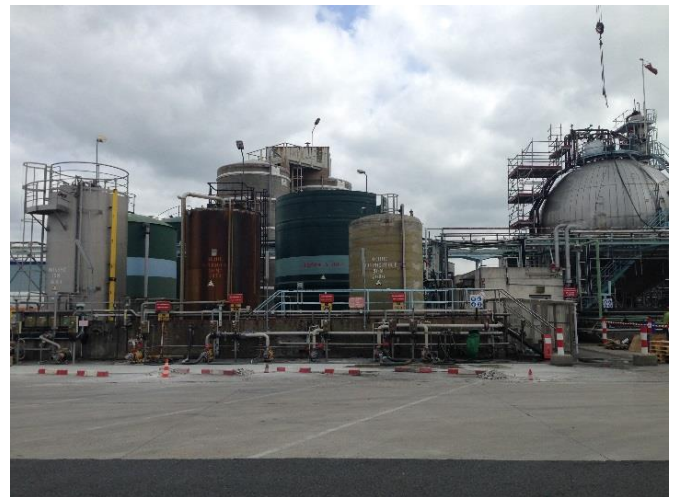
Production site in northern France; ammonia sphere on the right

A sensor cable with flexible metal inner and outer tubing was selected because of its optimal protection and strength, as well as its fast thermal response time and appropriate operating temperature range . The fiber was retrofitted to the bottom of the insulated pipes , and placed outside the insulation. Altogether approximately 1200 m of sensor cable was deployed.